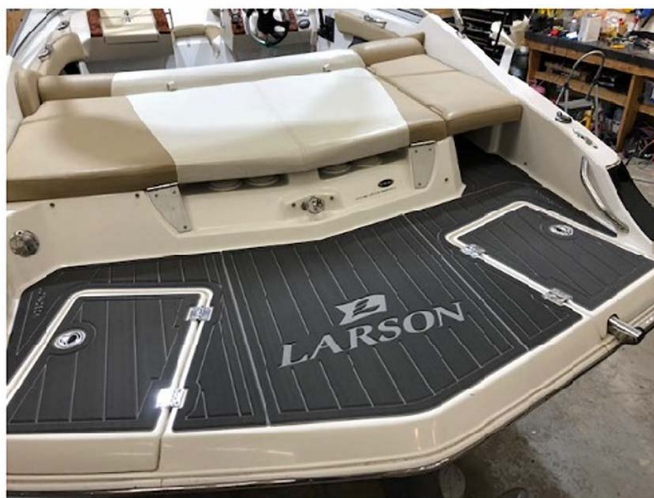
SEAMLESS INSTALL OVERLAP